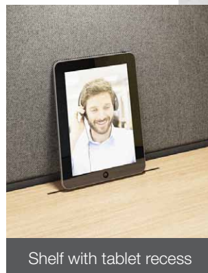
Shelf with tablet recess