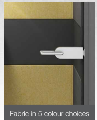
Fabric in 5 colour choices