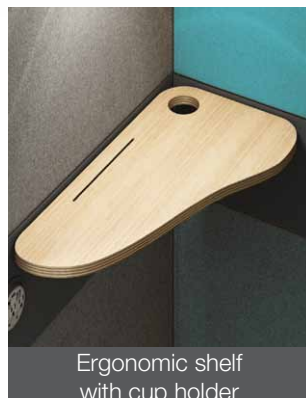
Ergonomic shelf with cup holder